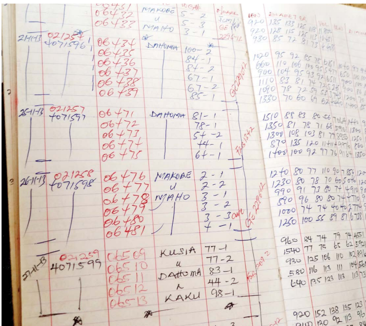
Timber tracking system, Ghana

In 2015, FLEGT has been in force for 12 years, and the EUTR for two years. What does scientific evidence say about the effectiveness and impacts of these policy measures? Have they been successful in tackling the trade of illegally harvested timber, and in promoting good forest governance?