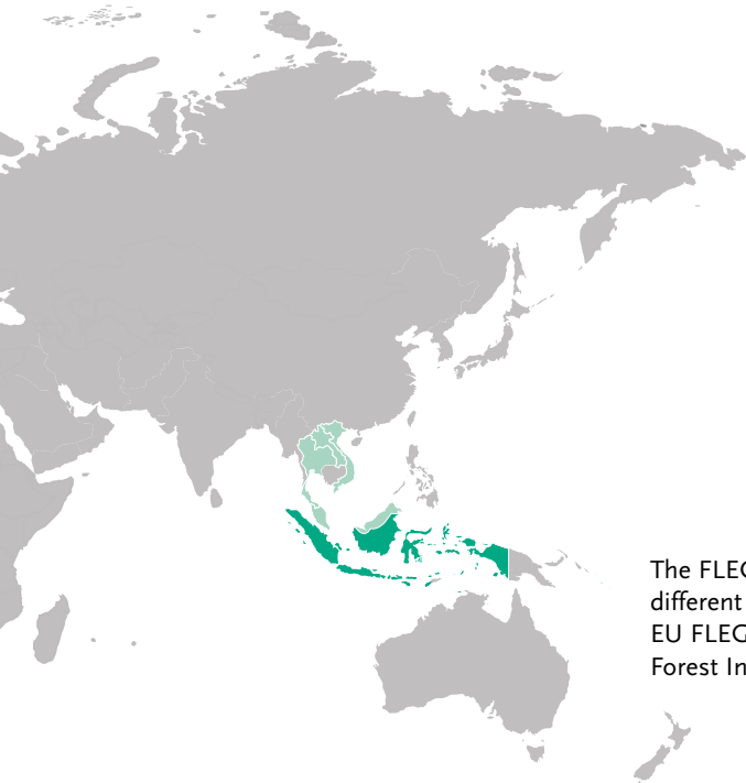
The FLEGT VPA process in different countries. EU FLEGT Facility, European Forest Institute

More research is needed to verify these kinds of supply diversions.