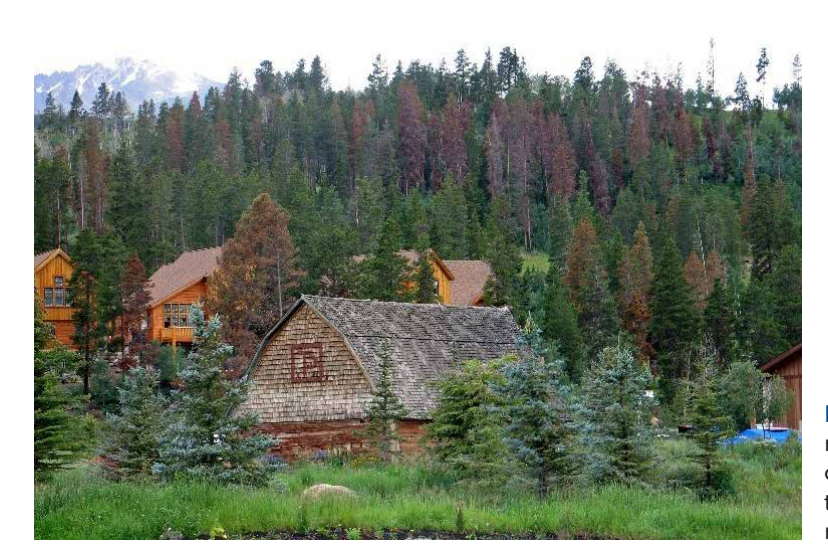
Figure 6. Pine mortality due to mountain pine beetles in the vicinity of human settlement in north-central Colorado, USA.

knowledge about beetle disturbances and relationship with land managers. People's perception of the risks posed by bark beetles generally increases with age, hazard experience, and being more informed about forest disturbances. By contrast, the relationships between risk perception, gender and satisfaction with (or trust in) forest management are rather mixed and unclear.