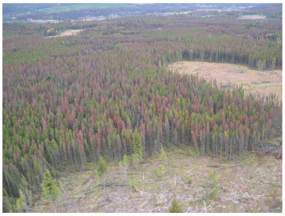
Figure 14. Aerial photo of lodgepole pines killed by the mountain pine beetle in British Columbia. Sanitation cutting can be seen in foreground.

outbreak dynamics, basic biology, environmental and economic impacts, and management following these outbreaks, so some insights are provided here. The mountain pine beetle, Dendroctonus ponderosae is native to the pine forests of western North America. These expansive forests tend to be relatively low in species diversity and are managed primarily for multiple-use purposes such as timber production, recreation, and grazing (often on government land), and in some areas as wilderness (roughly equivalent to the high conservation value forests of Europe). Intermittent synchronous outbreaks have occurred across much of this region over recent centuries (Jarvis and Kulakowski 2015). These outbreaks, along with wildfires, represent important natural disturbances that play key stand replacement roles.