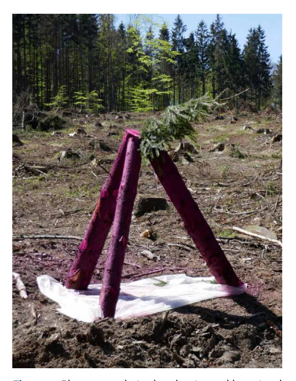
Figure 9. Pheromone-baited and poisoned log tripod used to trap bark beetles, Czech Republic, Libavá, 2018.

Trapping techniques include the use of traps baited either with species-specific pheromones or host compounds that may attract a variety of woodboring insects. A related strategy involves the use of pheromones to attract beetles to trap trees or log traps; once attracted, beetles can either be killed with pesticides or removed by harvesting the logs. To date, there is little scientific evidence that trapping either with pheromone-baited traps or trap trees is effective