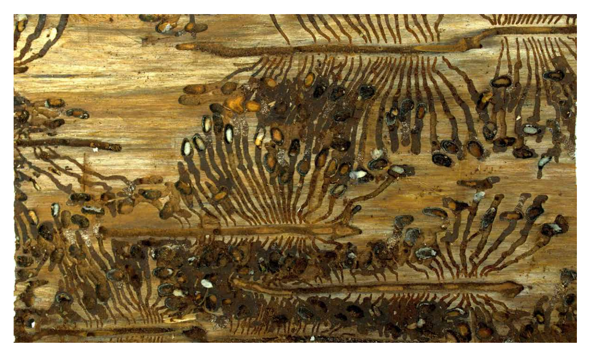
Figure 1. Galleries of the spruce bark beetle Ips typographus with larvae.

Adult bark beetles enter the bark, construct small chambers in the inner bark and attract mates. After copulation, females construct long galleries along which they lay eggs. If a high number of beetles attack the same tree, mated females may re-emerge and establish so-called sister broods in trees that are