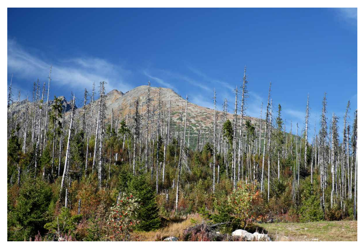
Figure 11. Disturbance legacies, High Tatras, Slovakia.

completely is neither possible nor desirable. Forests are remarkably resilient ecosystems.