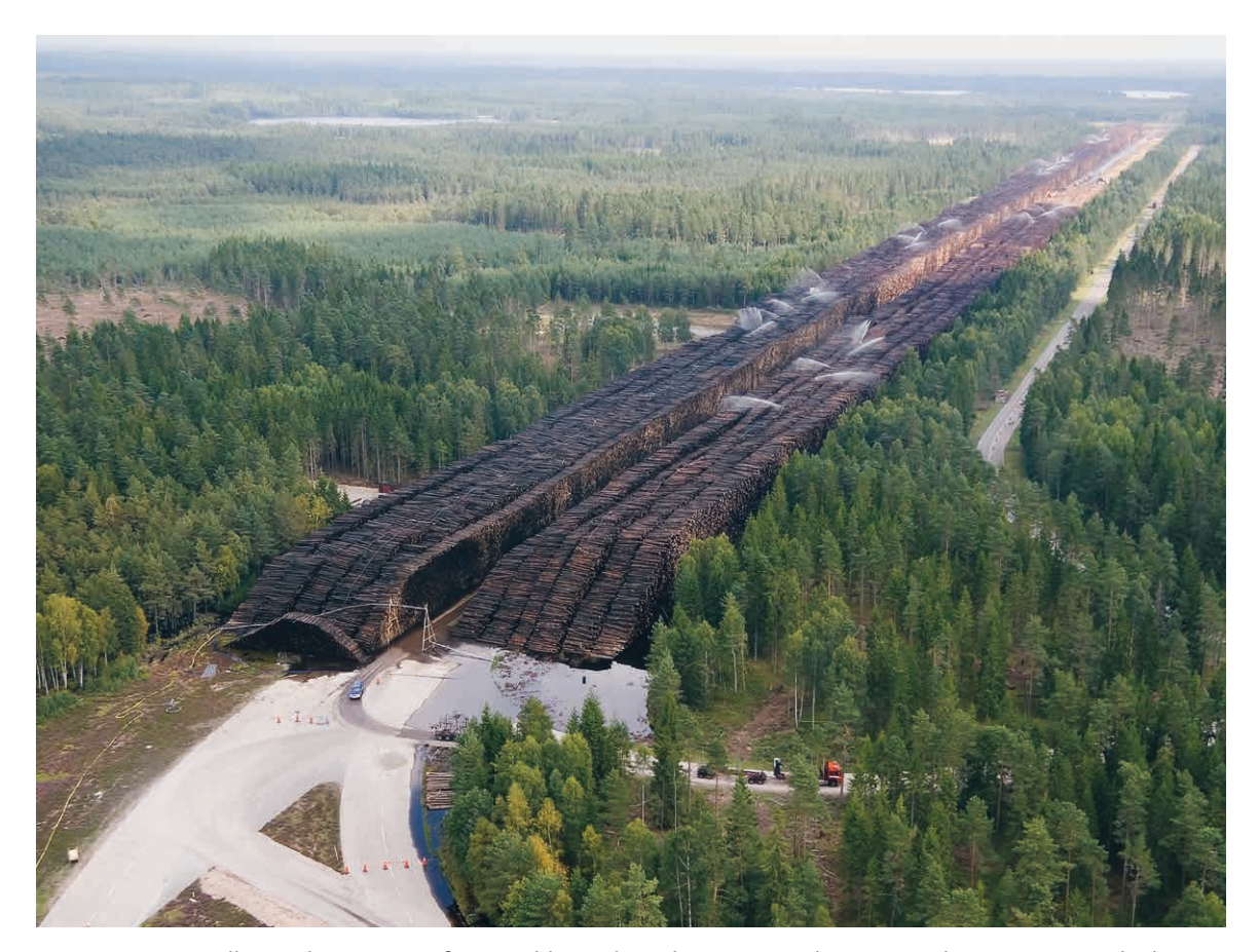
Figure 13. One million cubic meters of spruce blown down by storm Gudrun in Sweden in 2005, stacked on an abandoned airfield in Southern Sweden.

A massive effort was made to quickly remove felled and damaged trees from the forest, in order to reduce timber quality losses and prevent an outbreak of the spruce bark beetle. Measures included tax reductions on sold wood, reduced wood transportation fees, tax-free diesel for forest machinery, and subsidies on storage of wood. Temporary programmes were set up to monitor bark beetle