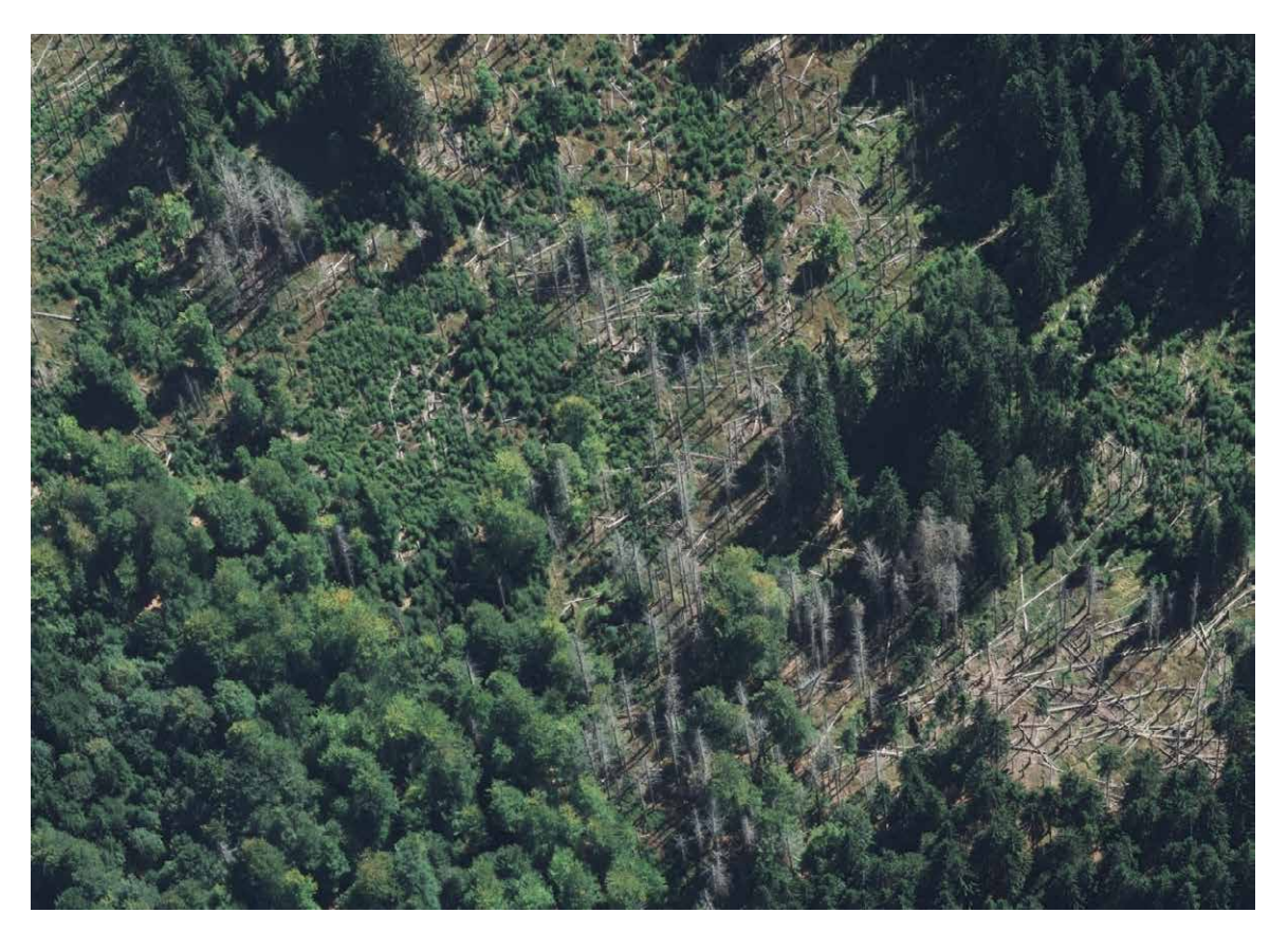
Figure 12. Aerial photo of a spruce forest with a high structural diversity in the Bavarian Forest National Park, Germany. Author: Jörg Müller.

How can we strengthen resilience in management? Resilience-based management is often fundamentally different from approaches aiming for risk reduction. While the latter aim to prevent disturbances, resilience thinking acknowledges that disturbances are a natural part of ecosystem dynamics that cannot be completely controlled (Holling and Meffe, 1996). The prevention of natural disturbances is in conflict with natural ecosystem dynamics (and thus not consistent with ecosystem-based or close-to-nature management). Furthermore,