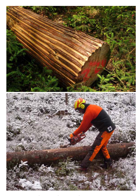
Figure 8. Bark scratching in the Bavarian Forest National Park, Germany.

emerging beetles using debarking and an 89% reduction using bark scratching, compared to untreated control trees. Bark scratching has little impact on deadwood biodiversity, is more attractive than debarking for visitors, and is cheaper when done with a recently developed device (Hagge et al. 2018). Here the impact was shown even for already infested trees. However, the efficacy of this within-tree procedure in stand- and landscape-level protection is contingent on the efficacy of detection of infested trees and their extraction.