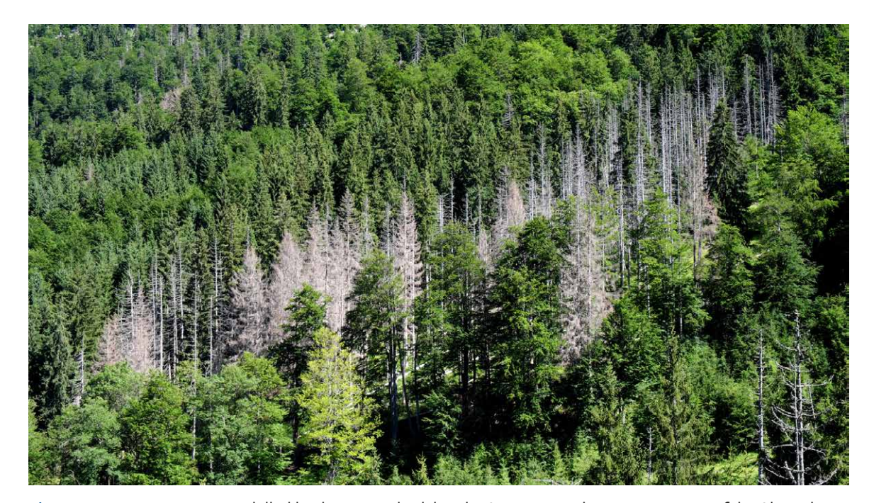
Figure 2. Norway spruce trees killed by the spruce bark beetle, Austria, Northern Front Range of the Alps.

Trees have sophisticated chemical, anatomical, and physiological defences that enable them to resist attack by bark beetles most of the time. Examples of tree defences include necrotic lesions that form around beetle attacks in the bark, combined with the production of terpenes and other toxic chemicals. These defences can be lethal to adult