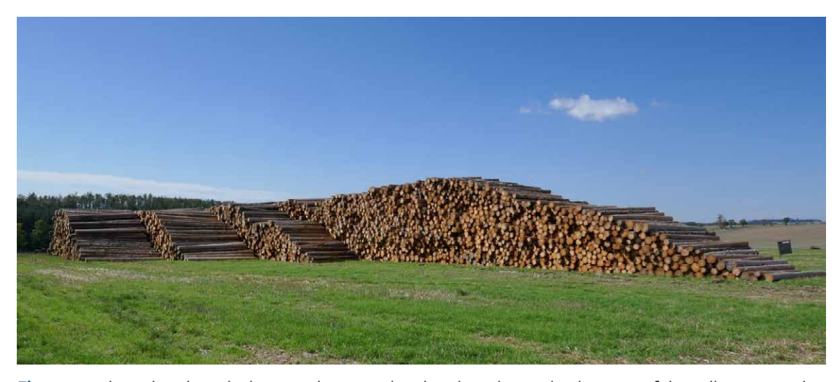
Figure 5. Salvaged timber which currently cannot be placed on the market because of the collapse in timber prices. Vicinity of bark beetle calamity area in the Czech Republic, Telč, 2018.

Figure 4. Impacts of bark beetle outbreaks on ecosystem services. The bars show the distribution of the evidence of bark beetle impacts (from positive to negative) on different ecosystem services collected from 41 scientific papers.