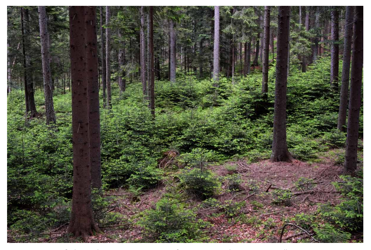
Figure 10. Layer of advanced regeneration in spruce forest, Austria.

Under some conditions salvaging costs might be higher than the value of the extracted timber. This is particularly relevant for the situation in Central Europe today, where a dramatic reduction in spruce timber prices and limited capacities for timber storage are questioning the economy of salvaging. Also, low value stands with a positive outlook for natural regeneration may generate greater stand value when left unsalvaged. Hence, leaving beetle-killed trees unsalvaged in the forest must be considered as a viable management option, particularly when the beetles have left and the trees are no longer an active source of beetles. Abandoning salvaging may also free up resources that can be used in a more efficient manner.