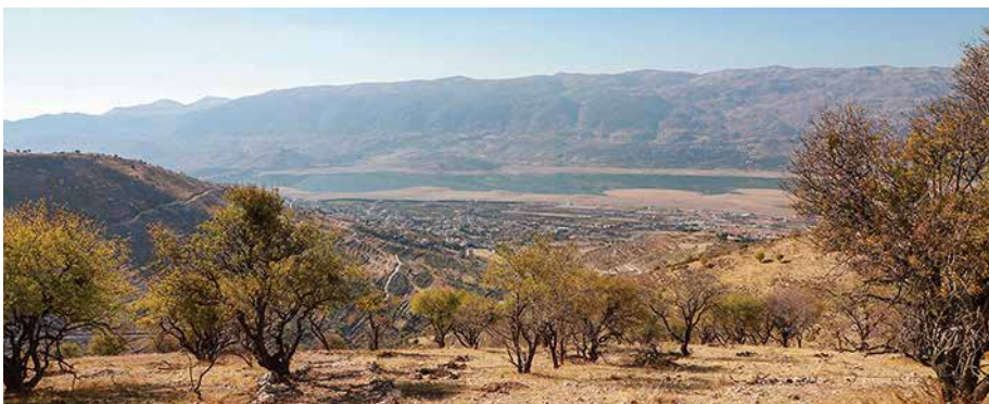
Qaraoun valley in West Bekaa, Lebanon.