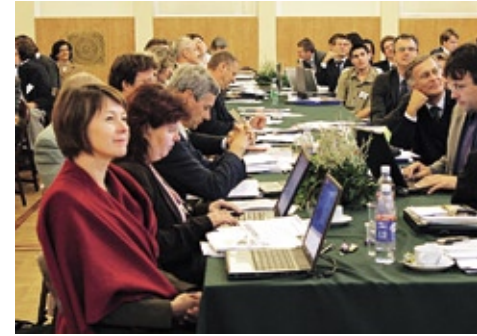
A full house at the EFI Annual Conference.