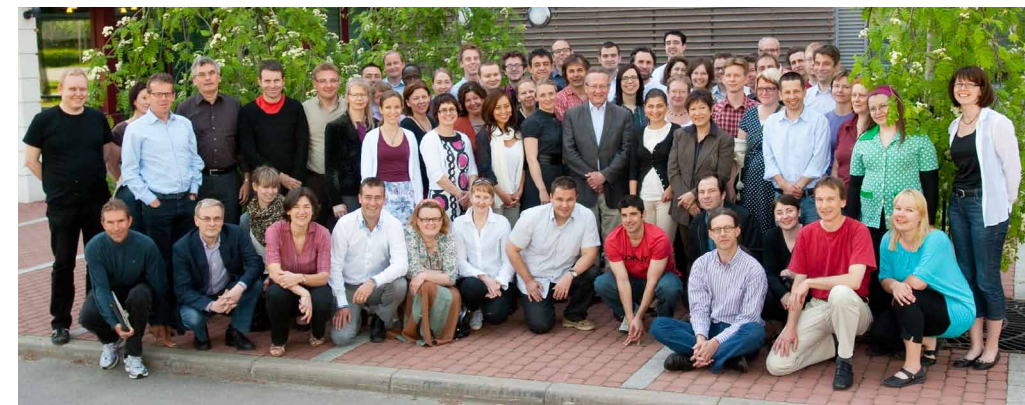
EFI staff during 2011 EFI week in Joensuu.

Mobilising young researchers within our Associate Member network and beyond strengthened. Our Winter-Summer School 2011: "Making Values Work – Exploring Multiple Perspectives in Understanding the Valuation of Forest Ecosystems" was a great example of such activities. Our Winter-Summer School (WSS) is a model of graduate education aimed at creating collaborative research networks on topics of high relevance for forests and the environment at the European scale. The WSS has built capacity for high quality research through innovative teaching methods and leading experts. Our flagship of capacity-building activities, the FOPER II (Consolidation of the Human Capacities in Forest Policy and Economics Education and Research in the South-East Europe Region) project, strengthened its network, and was instrumental in the success of the WSS.