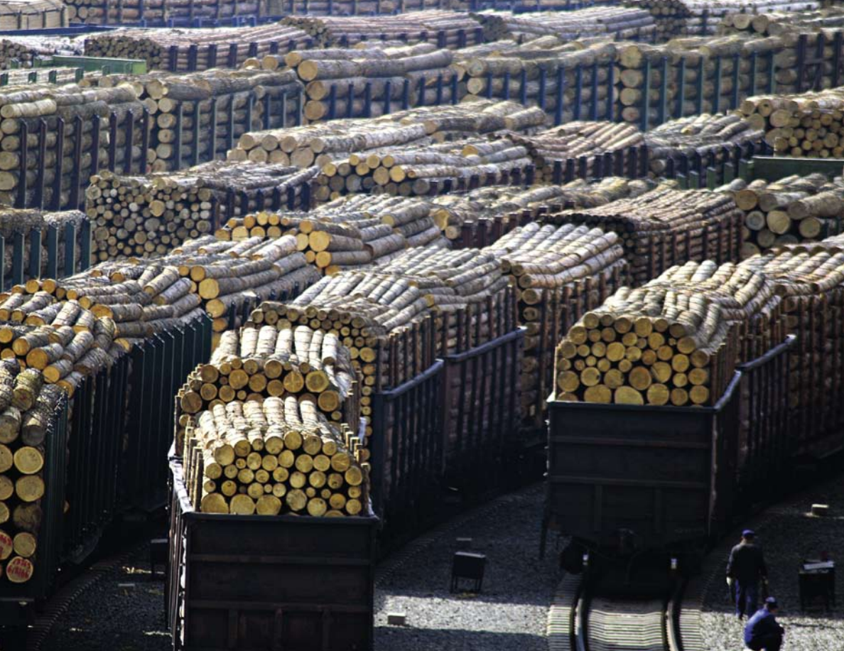
Environmental Investigation Agency