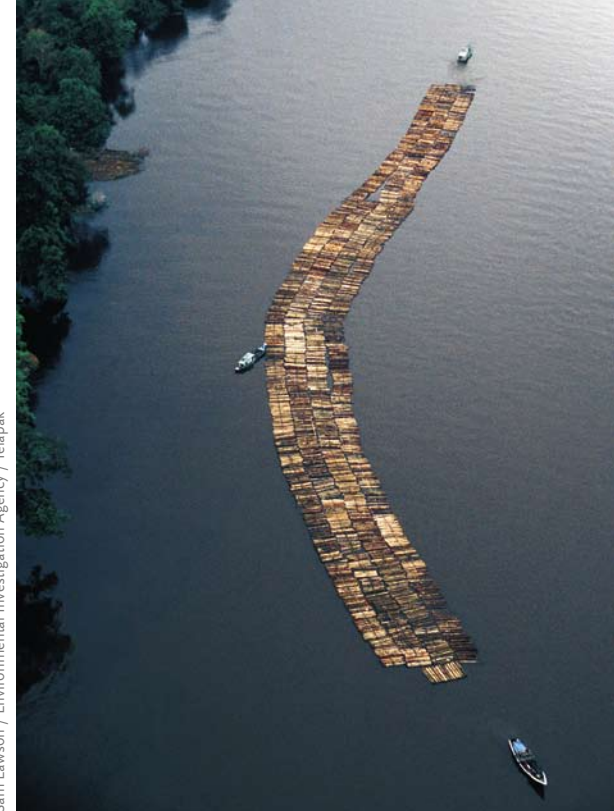
A raft of illegal ramin ( Gonystylus spp.) logs on the Seruyan River near Tanjung Puting National Park, Indonesia.