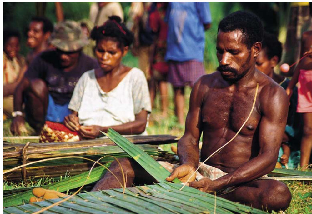
Villagers making matting for their houses, Manggroholo, West Papua.