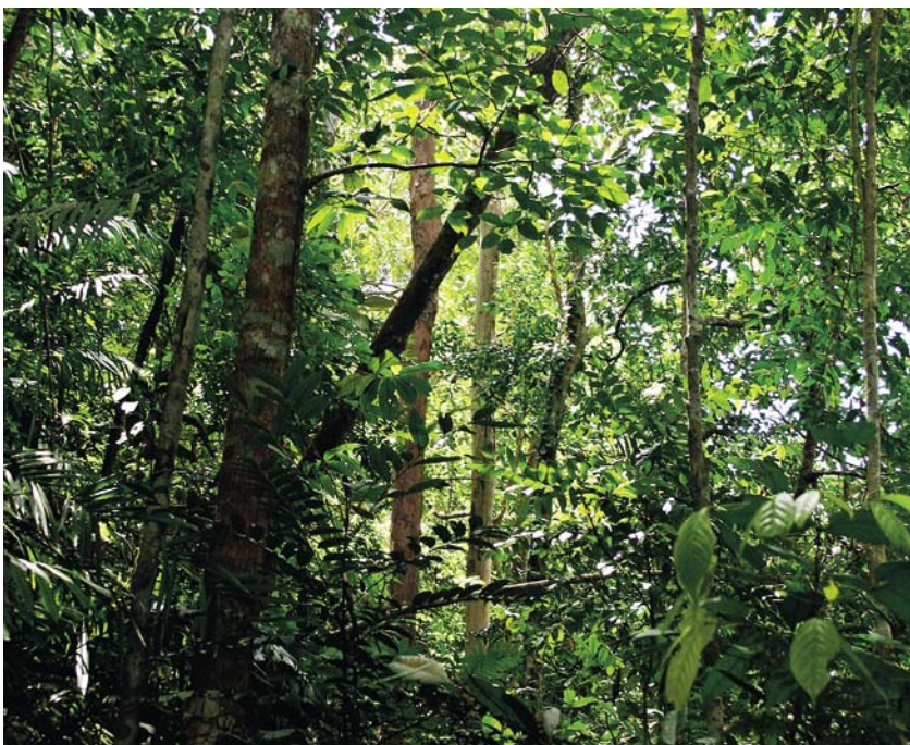
Dense understorey in the rainforest of Bako National Park, Sarawak, Malaysia.