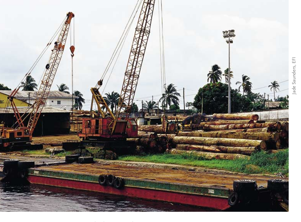
Logs in harbour in Kribi, Cameroon, waiting to be shipped to Doula for international export.