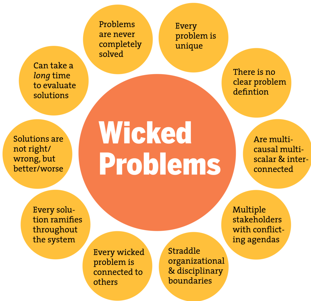
Based upon Rittel and Webber (1973)