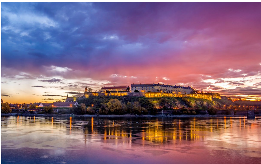
Figure 4 - Petrovaradin Fortress.

Return buses will leave at 22:30 from the parking area in front of the "Terasa" restaurant. The buses will make stops in front of the hotels Aleksandar, Prezident, and Centar (the last stop).