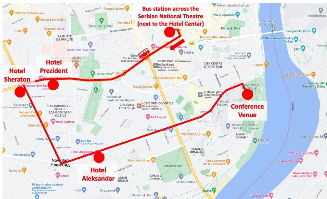
Figure 3 - Transportation of participants from hotels to the conference venue.

Each bus will be labeled EFI 2023 and will be escorted by host representatives.