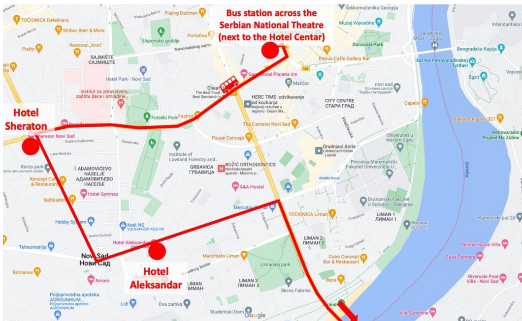
Figure 4 - Transportation of participants to the field trip.

The bus will be marked EFI 2023 and will be escorted by host representatives.