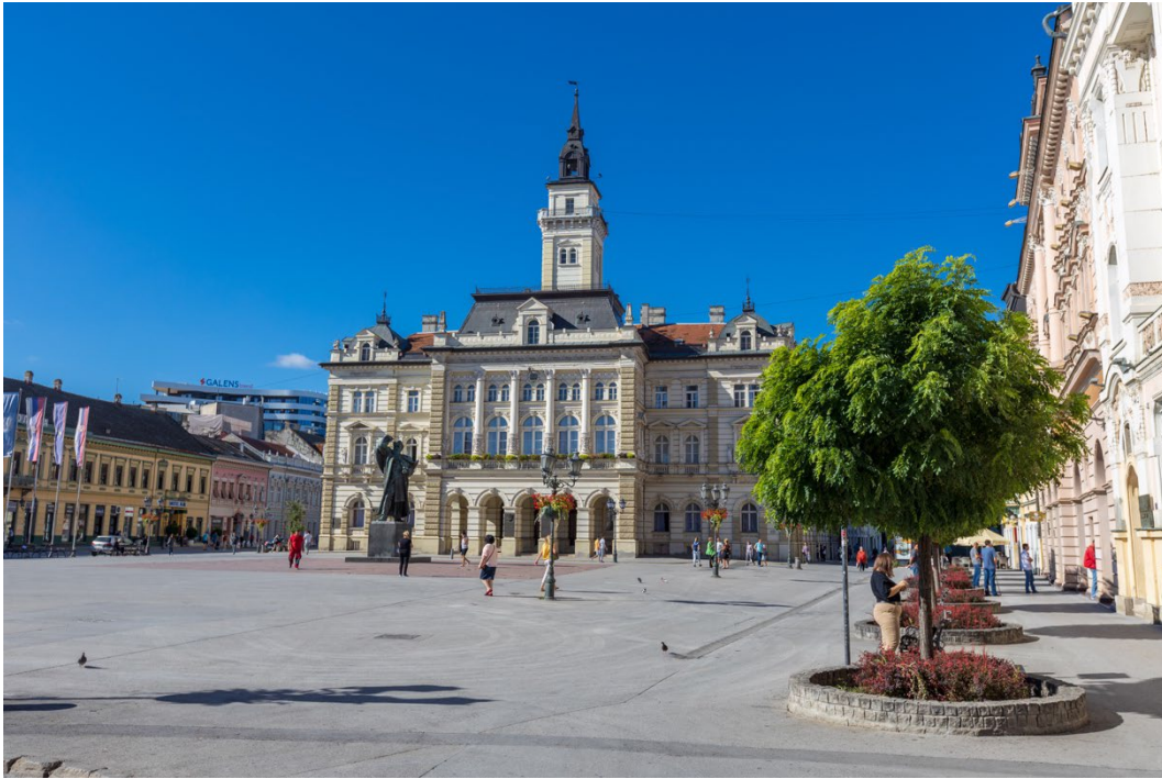
Figure 1 - Novi Sad City Hall.