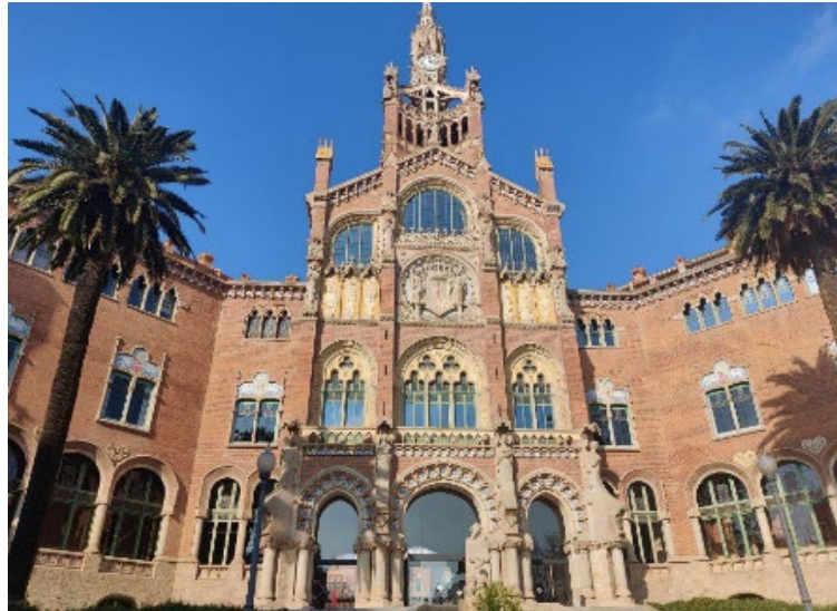
Entrance of the meeting venue Recinte Modernistas Sant Pau

Union for the Mediterranean Union pour la Méditerranée الاتحاد من أجل المتوسط